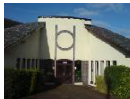
26 September Bethel Christian Centre Conference

12 October Age Concern North Staffordshire