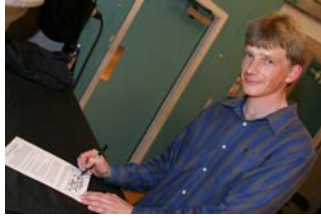
Conductor of the Royal Philharmonic Orchestra