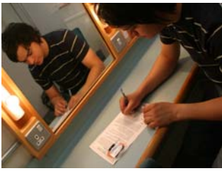
Get Cape, Wear Cape, Fly