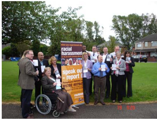
'City groups unite in war on racism' Sentinel 20 September

'Volunteer leaders add their names to the campaign'