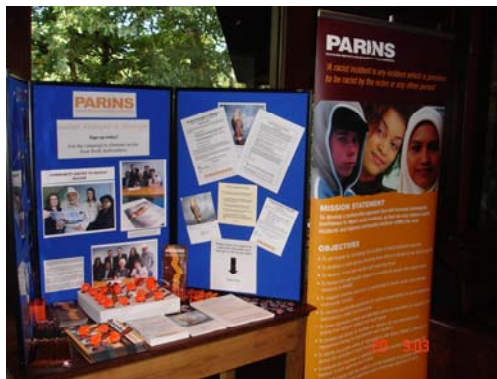
20 September Holocaust Memorial Day at the New Vic Theatre